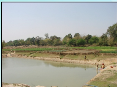
Excavated pond at Purulia and cultivation of Rabi crop using water from the pond