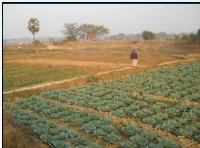
Pond Based Market linked vegetable cultivation at Narrah Village, Purulia