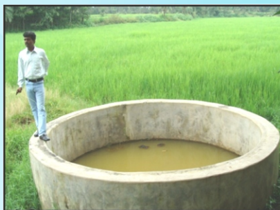
Dugwell at Purulia at present, with crops being irrigated