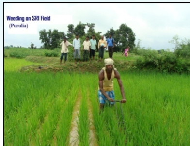
Weeding of SRI field