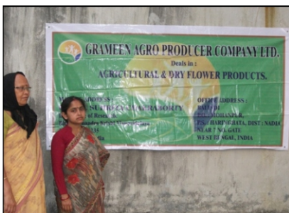
Two Producers Companies functioned by CTRD